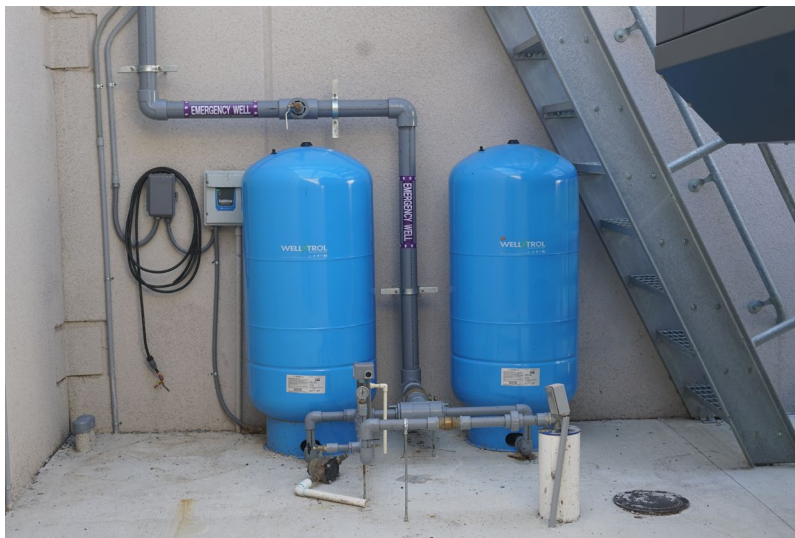
Figure 3: Example of a groundwater well that was used only to provide water for flushing toilets

The solutions for intermediate and long outages can also be used for shorter-duration events, and these potable water solutions may have components that need to be powered by standby power; therefore, standby power will need to be sized for the increased load.