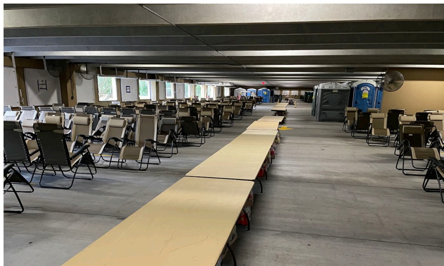
Figure 5: Example of portable water closets for use in a garage that was converted into an HES