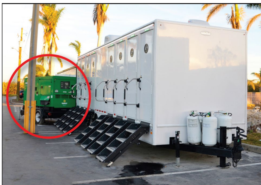
Figure 4: Example of portable shower trailer in Port Carlos Cove, FL

Portable water closets, handwashing stations, showers, or laundry units can be purchased or rented. Figure 4 shows an example of an eight-station shower trailer providing services to a heavily damaged area of Florida following Hurricane Ian. Power for the trailer is supplied by a portable generator, circled within Figure 4, and hot water is provided by an LP on-demand water heater with propane tanks, located on the “tongue” or front of the trailer. The trailer features a mechanical room (not shown in the photo) with a water tank. A waste holding tank stores the graywater. Maintenance of this trailer includes refilling of the propane tanks and water tank, and disposal of the waste holding tank.