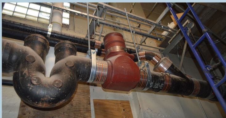
Figure 6: Example Backflow Preventor for sewer lateral

To prevent raw sewage from flowing into a building, some type of check valve or backflow preventer ( Figure 6 ) can often be installed to prevent floodwaters from pressurizing the system and entering the building. To mitigate the potential pressurization in the sanitary sewer system from floodwaters, an ejector pump can be installed to force the raw sewage past the backflow prevention device.