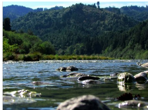
Image 4: A whole community approach to hazard mitigation helps the tribe combat flooding from the Mad River

The Tribe's low-carbon community resilience projects have earned them national and international recognition, including the DistribuTECH/PowerGrid International's "2018 Distributed Energy Resource Project of the Year" and the 2017 U.S. FEMA "Whole Community Preparedness Award" for proactive efforts to address emergency preparedness challenges, where the Tribe was selected as one of 11 Individual and Community Preparedness Award recipients from around the country. The White House also recognized the Tribe as a climate champion due to its pioneering commitment to cutting carbon pollution and preparing for the impacts of changing climate. 5