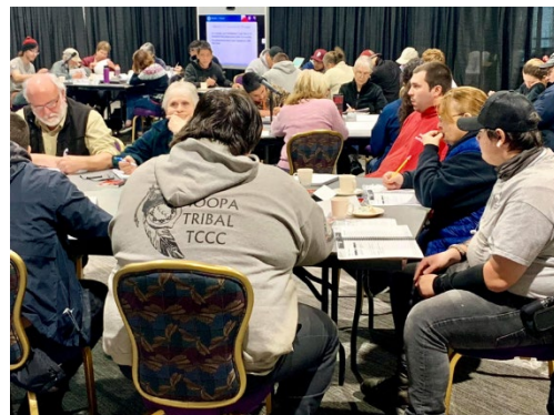
Image 5: Blue Lake Rancheria conducts trainings for the whole community at the RTIC

Though Blue Lake Rancheria has conducted training and exercises since 1983, the Tribe's remote location often makes traveling to pursue training outside of the region time-intensive and costly. Cost and travel time are increasingly significant obstacles as the need for self-sufficiency during disaster incidents increases, and the trainings that support self-sufficiency become more important. Additionally, Blue Lake Rancheria community members noted a lack of trust as a deterrent for some members to attend trainings in venues outside the reservation. These challenges inspired the Tribe to create the Blue Lake Rancheria RTIC , a training venue located within the BLR reservation, using 2016 THSGP funding. The RTIC