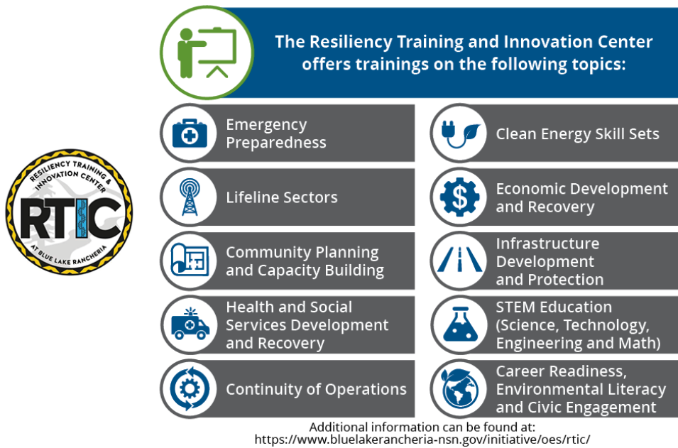
Figure 1: Training Courses Offered by the RTIC

BLROES also uses the RTIC as a base of operations, which proved especially useful during the COVID-19 pandemic. 7 During the onset of the COVID-19 pandemic, the RTIC was able to host county officials who discussed best practices to mitigate the outbreak and provided continued guidance throughout the pandemic. In addition, due to trainings offered by the RTIC prior to the COVID-19 pandemic and the relationships built in the greater North Coast region during these trainings, BLROES staff were trained in the Incident Command System, understood FEMA programs, and felt more comfortable and knowledgeable interacting with other partners in the North Coast region. The RTIC was also able to continue hosting its grant-funded trainings virtually when public health conditions necessitated closing the facility to the public.