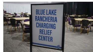
Image 10: The microgrid powered charging relief stations during the public safety power shutoff

The Tribe's microgrid is vital to providing essential services, such as water, food, and communication, during disaster incidents, which has resulted in multiple impacts, including lives saved in the community. 15 When California's largest electric utility provider shut off power to surrounding regions in October 2019, the Blue Lake Rancheria renewable energy microgrid aided in not only providing the Tribe with power, but also enabled the Tribe to provide those