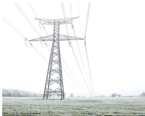
Ice covers electrical sources