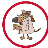
Common OIG Findings